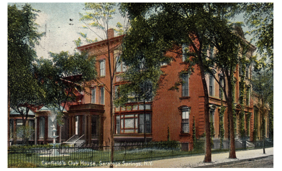
The Canfield Casino in the early 1900's

In 1913, the once great Congress Hall Hotel, which bordered Broadway opposite the current Visitor Center, was acquired for back taxes. The hotel and other structures, including Hamilton Spring and the Congress Spring bottling plant, were razed by the village in 1913. The section of Putnam Street that once intersected East Congress Street, was obliterated. Landscape engineer Charles Leavitt was retained to design a master plan for this new section of the park. In the 20th century, anti-gambling legislation, two World Wars and the Depression brought hard times to Saratoga Springs.